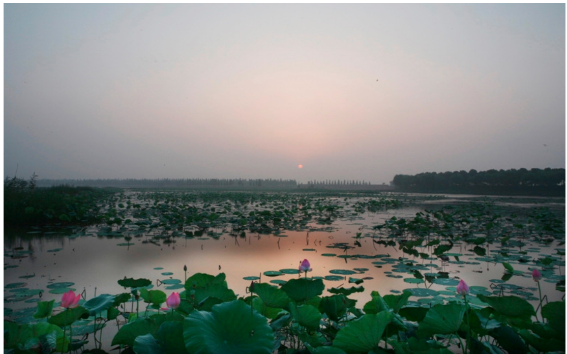
There used to be many lakes on the Jianghan Plain in Hubei, but the total lake area has declined greatly as a result of conversion to agricultural land, with the area of Hong Hu (CN351) reduced by almost half within 50 years.